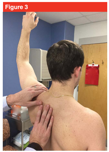
Scapular assistance test.

No likelihood ratios are reported in the literature, making it difficult to determine how much these tests change the pretest probability (Table 2). Furthermore, none of these tests have been consistently reported to have high specificities or sensitivities or greater than fair-to-moderate interreliability.<sup>9-13,15</sup> These tests should be interpreted with caution secondary to the challenges associated with assessing scapulothoracic motion