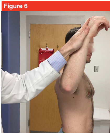
Patte or Hornblower test.

This test is performed by having the examiner support the patient's elbow in 90° of flexion with the arm abducted in the scapular plane while the patient is asked to externally rotate the arm against resistance<sup>19,27</sup> (Figure 6). A positive test result is indicated by the inability to externally rotate against resistance (Video Hornblower, Supplemental Digital Content 16, http://links.lww.com/JAAOS/A240).<sup>19</sup>