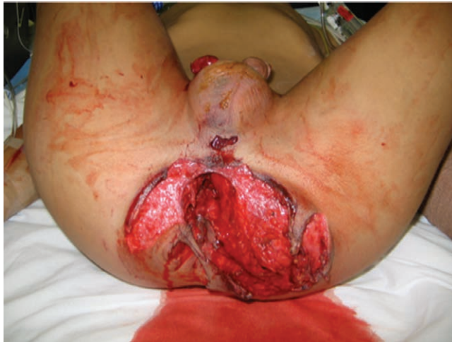
FIGURE 2. Blast injury to the perineum requiring diverting colostomy.

review will cover the current recommendations for the management of trauma to the intra- and extraperitoneal rectum and anus.